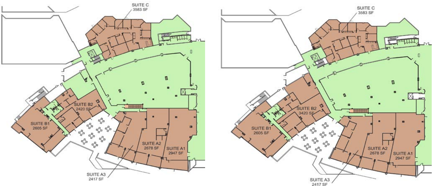
POTENTIAL SPACE LAYOUTS