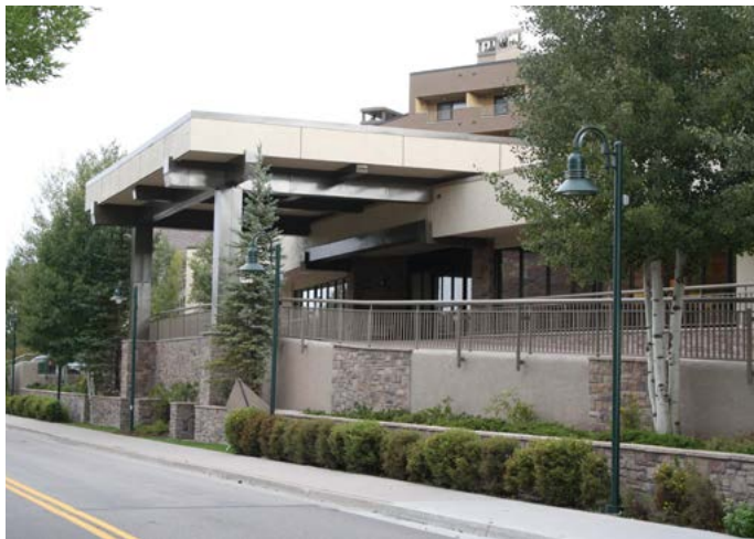
VIEW OF MAIN ENTRANCE