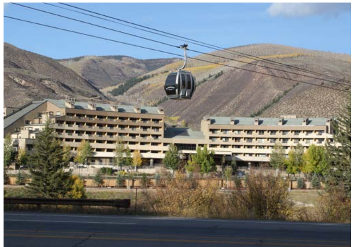
VIEW FROM RIVERFRONT LANE & U.S. ROUTE 6