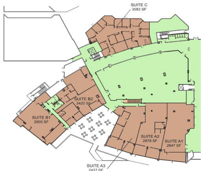
POTENTIAL SPACE LAYOUTS